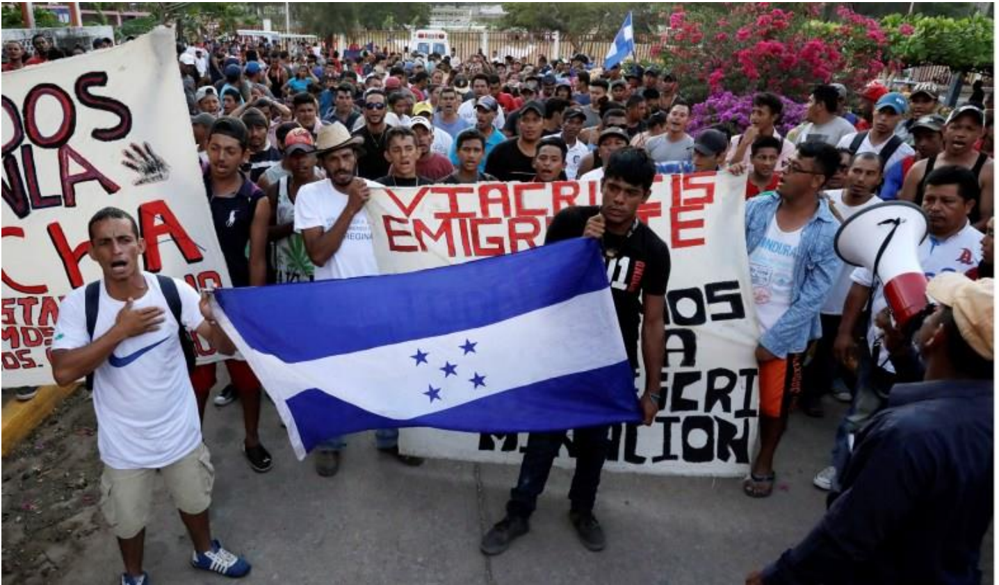
They bring their flag and burn ours!