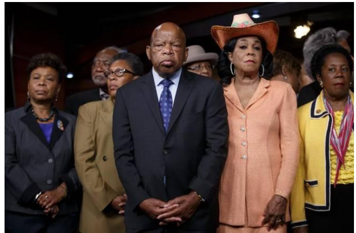
These Black Americans vow to boycott Trump's inauguration (again)